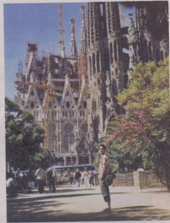
21st birthday in Barcelona