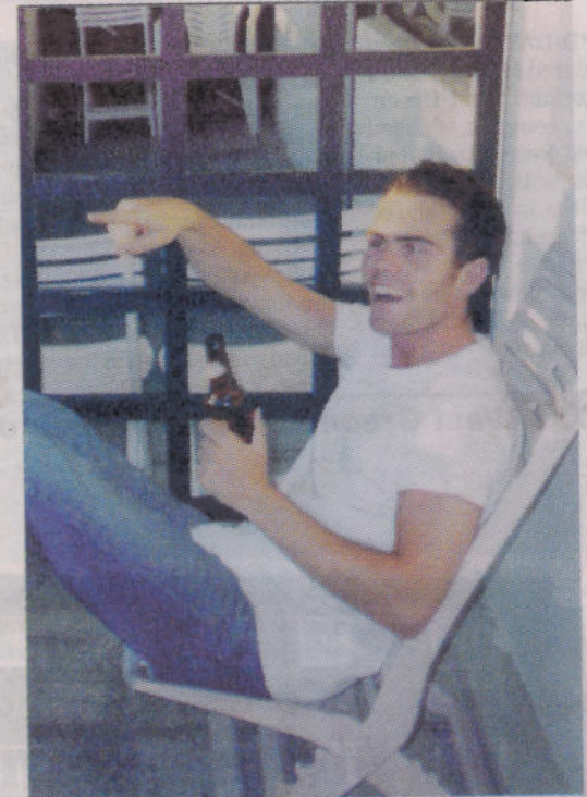
Relaxing on holiday in Bulgaria

Further information can be obtained via www.ourmartykelly.com